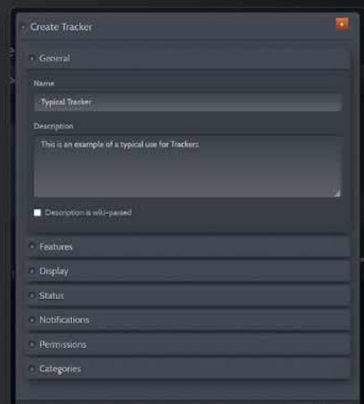
Create Tracker Modal Popup