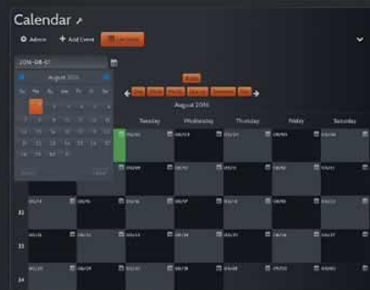
Calendar - Add Event

See http://pixelkit.com/previews/dark-ui-kit for a look at the PixelKit Dark Velvet original page elements.